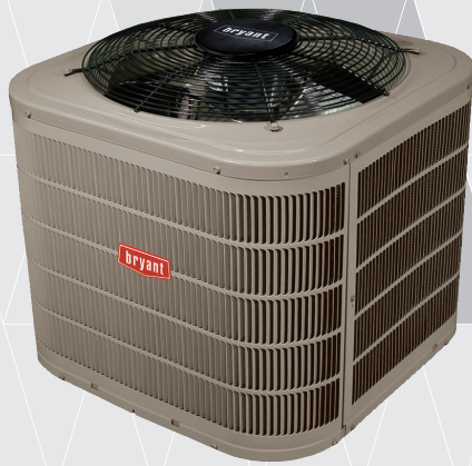
Models 227T, 225S